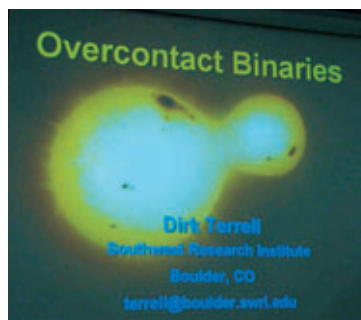
The sky is full of these amazing stars, but they are not well understood.

For those of you who have never attended a meeting of this nature, I highly recommend it. You will be astounded at the quality of the talks by amateur astronomers whose driving forces is a love of sky, and the awesome research of the professional astronomers. The next meeting in 2006 will be in Washington, D.C., but the 2007 meeting will likely be in Calgary in conjunction with the General Assembly. This meeting would be easily accessible to all of our members!